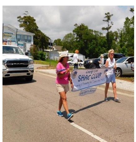
Pics from 2019

We are going for the G.O.L.D. in the 2023 SOS Spring Safari Parade on Saturday, April 22! We are the proud recipients of the second-place plaque from 2019. Now we need to come in FIRST with a win over the North Myrtle Beach Club! The theme